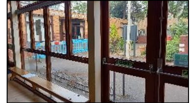
Shenton Primary School