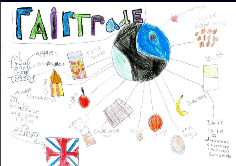
Thank you to Crown Hills Community College, English Martyrs' Catholic School, Granby Primary School, Humberstone Junior Academy, Mellor Community Primary School, Sandfield Close Primary School, Whitehall Primary School and Rolleston Primary School for their contributions of artwork for the Trail.